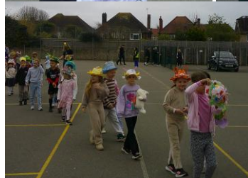
A selection of some of your egg-tying designs!